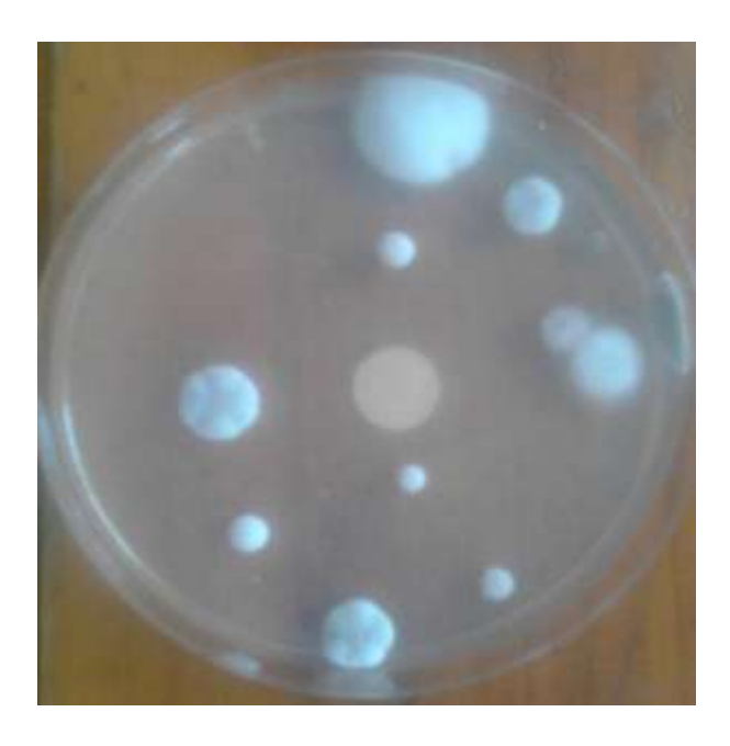
Figure 2: Pure culture of Penicillium sacculum growing on sabouraud dextrose agar.

Identification of the isolates based on cultural characteristics, colony morphology, motility and biochemical characteristics are presented in Table 2 and 3. The bacteria isolates were identified as Geobacillus sp. , Bacillus sp. , Escherichia coli and Proteus mirabilis , while the fungi were Fusarium oxysporum , Aspergillus nomius , Penicillium sacculum (Plate 1), Mucor sp. and Rhizopus sp.